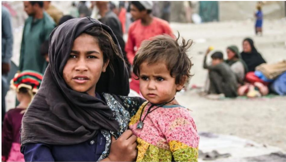
Siblings who arrived from Afghanistan with their families are seen in Pakistan on Sept. 1. Thousands, if not millions, of people are expected to attempt to escape Afghanistan, leaving nations in the region anxious about a flood of refugees coming in.

Located in the crossroads of Central Asia, Afghanistan has endured many years of war and political instability. After the Taliban seized power, many people fled to the borders of neighboring countries and became a group of displaced refugees. The crisis of millions of refugees has brought urgent and long-term needs. They are faced with a situation of lack of living materials and extreme spiritual hardship. They are a group in the dark waiting for "Good news".